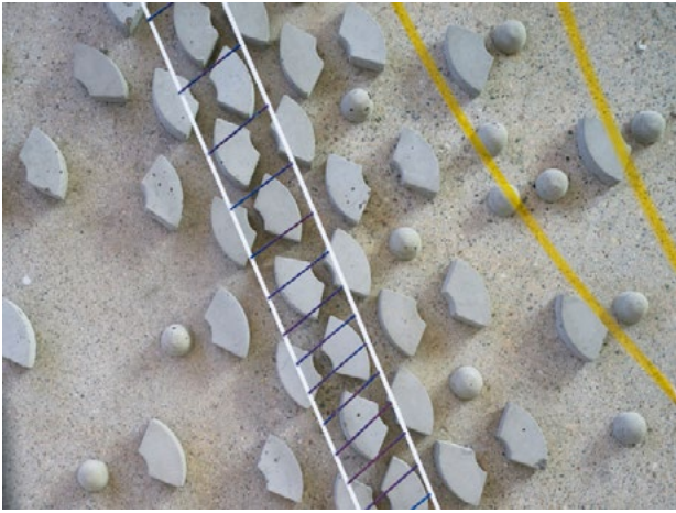
Heather Lamanno P.S. I love you, Rietveld Balsa wood, cast concrete, transparent tape Dimensions variable 2018