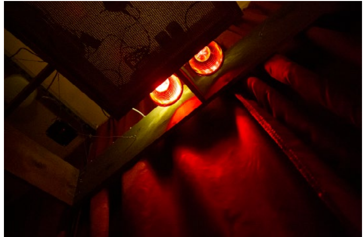
Jennifer Jurgens The Arm's Closet 5-channel sound installation: wood, wire, LEDs, Fresnel lenses, speakers, media players, heavy satin 12 x 5 x 2 2018