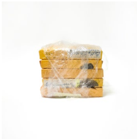
Grace Olson Father Archival pigment print 12 x 12 2017