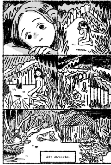
Simone Yijun Zheng It Was A Good Day Zine 2019