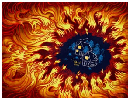
Yi Wan Wildfire Digital 2017