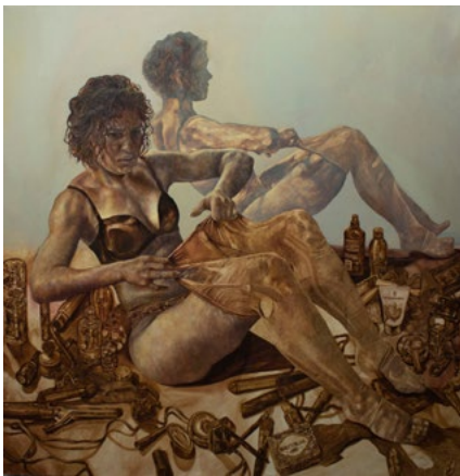
Clarissa Odin Self-Portrait with Nylons Oil on Canvas 60 x 60 2018