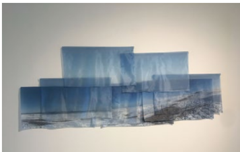
Cassandra Cook Duluth, MN Archival ink jet on silk 2018