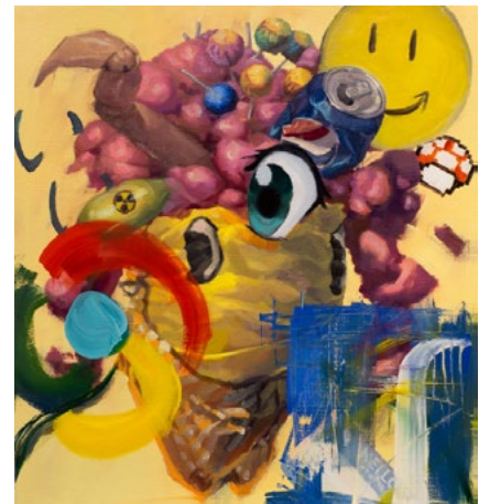
Yuta Uchida Self-Portrait Oil 22 x 20 2019