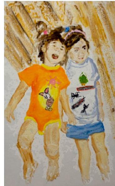
Anika Schneider Little Critters Oil paint between two layers of duralar 40 x 25 2019