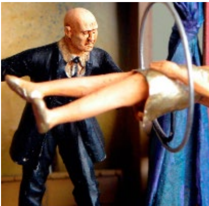
Howard Quednau The Illusionist