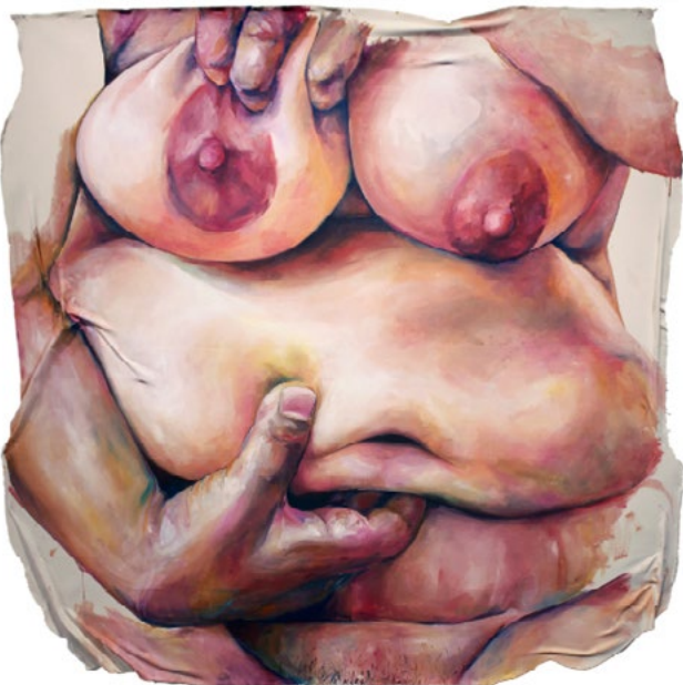
Erin Sandsmark Fold Acrylic on Canvas