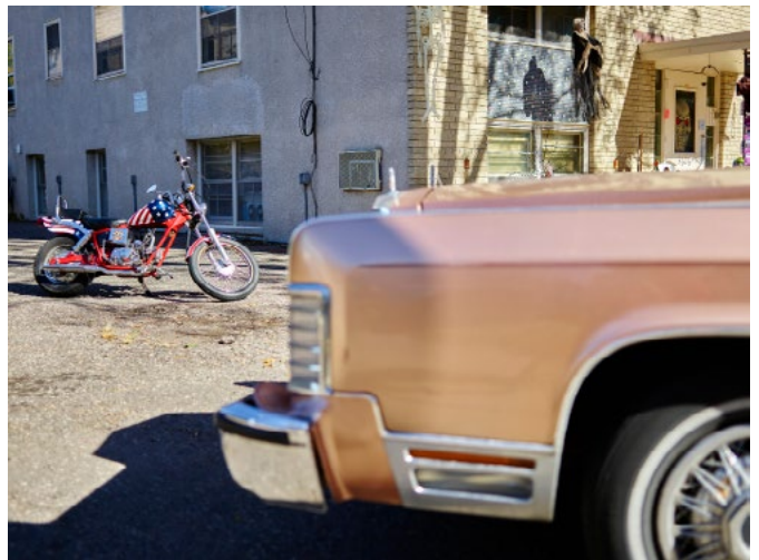
Shiraz Mukarram The Parking Lot #01 Film still