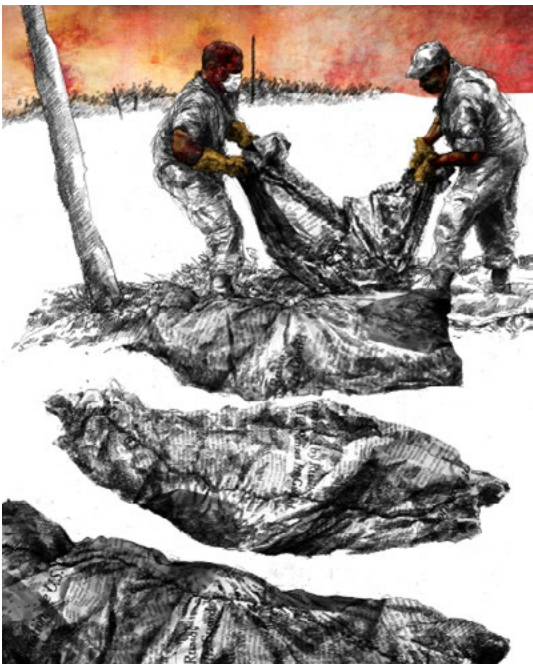
Jacob Yeates Headline Count (Ukraine) Graphite, Collage, Mixed Media