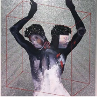
Paper won't hold the wound I leave Devan Shimoyama