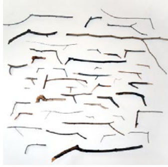
Cross for the Unforgiven Mel Chin